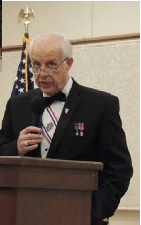
Left and Below: Honor Guard